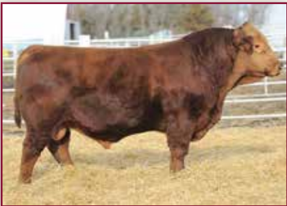
CDI VERDICT 220Y Verdict is the bull to bring down birth weight, frame and add fleshing ability, and beautiful udders. He is easily the highest red API bull in the breed. Semen available through Wilkinson Farms and C Diamond. DDC.