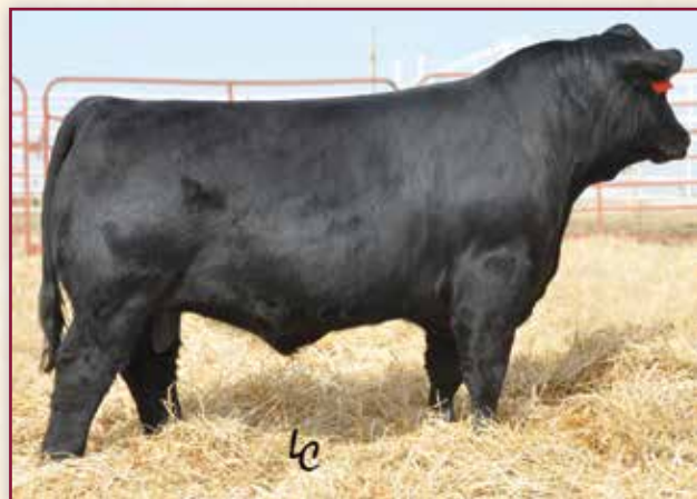
HOOKS YELLOWSTONE 97Y // SIRE TO LOT 1