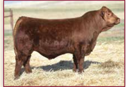
WS PRIME TIME B6 Prime Time is probably the bull we've raised that has attracted the most interest ever. We have great expectations for his progeny. We are selling a handful of cows with his service in this sale. Semen available through Wilkinson Farms and C Diamond.