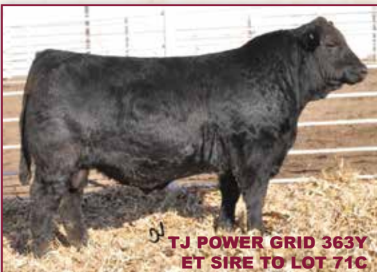
TJ POWER GRID 363Y ET SIRE TO LOT 71C