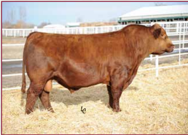
WS BEEF KING // SERVICE SIRE TO LOT 74

There are 20 bred cows for sale. Most are pasture bred to our Herd Sires with several bred to WS Beef King. Included is a small dispersion of daughter Makayla's five cows. Four of the five are AI bred and sexed. All cows will be PG checked again. They are all poured and been on Scour Bos 9 pre calving program. There are four young cows we chose who are bred to WS Prime Time, the bull we sold half interest to C Diamond last year.