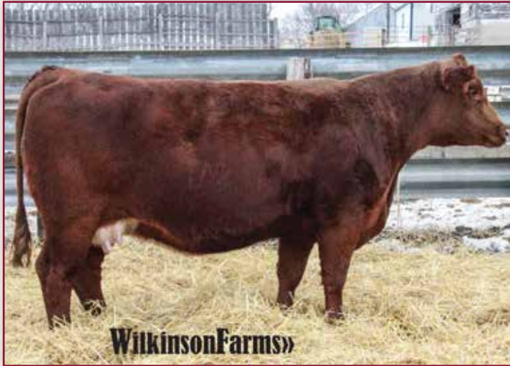
HSF MISS SKY 87U DONOR DAM FOR LOTS 71A, 71B & 71C