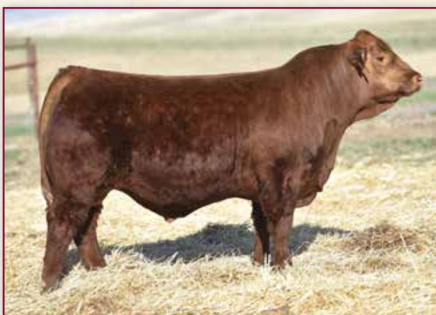
WS PRIME TIME SERVICE SIRE TO LOTS 91A & 91B