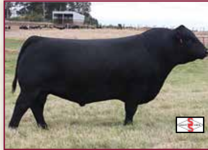
GW-WBF SUBSTANCE 820Y We used Substance as an outcross Black Sire, because we could use him on almost any cow. His EPD profile reads like a dream, and his calves have not disappointed. Can't wait to calve daughters.