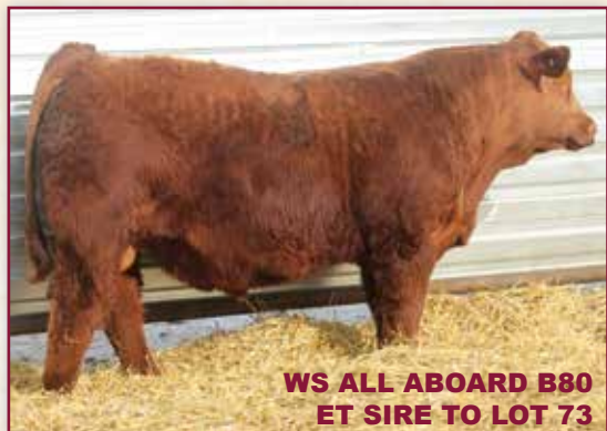
WS ALL ABOARD B80 ET SIRE TO LOT 73