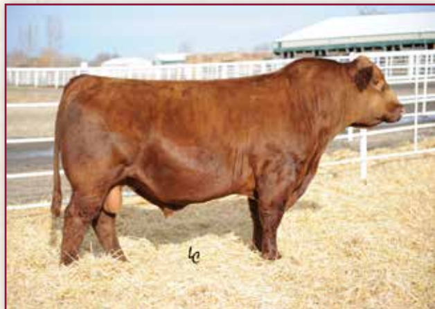
WS BEEF KING W107 SIRE TO LOTS 91A & 91B