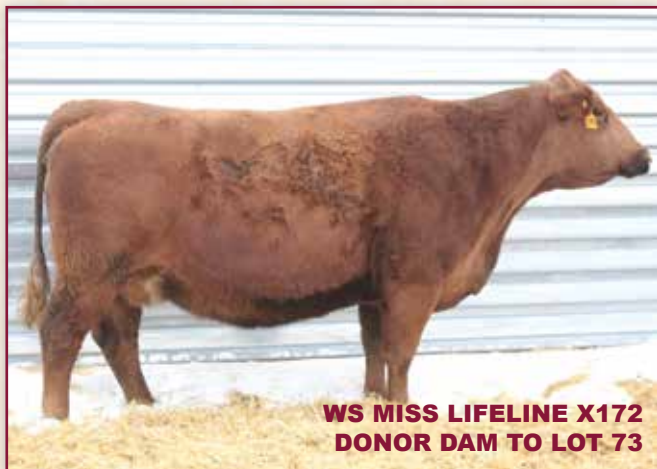
WS MISS LIFELINE X172 DONOR DAM TO LOT 73