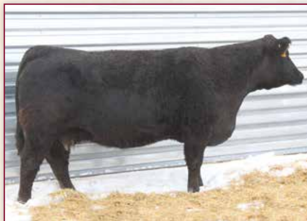
WS LITTLE SISTER W37 // DAM TO LOT 29