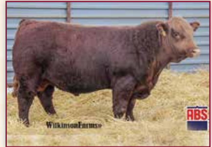
WS PRIME BEEF Z8 He has done two it two years in a row. Breed leading calving ease and birthweight to breed leading growth. Unheard birth to yearling spread of -1.5 to 114. We can't wait to calve his daughters.