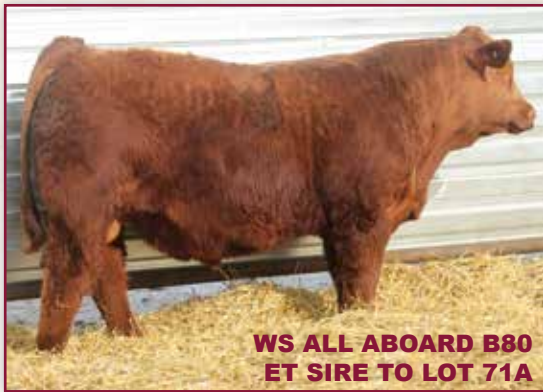
WS ALL ABOARD B80 ET SIRE TO LOT 71A

Embryos by HSF Miss Sky 87U- Dam of ABS' WS Prime Beef, & Accelerated Genetics' WS Zenith. Embryos are stored at Trans Ova, Sioux Center, Iowa.