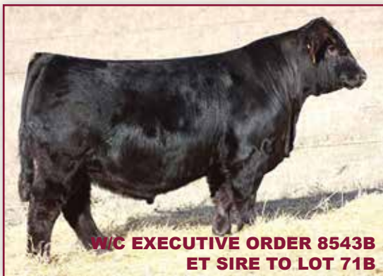
W/C EXECUTIVE ORDER 8543B ET SIRE TO LOT 71B