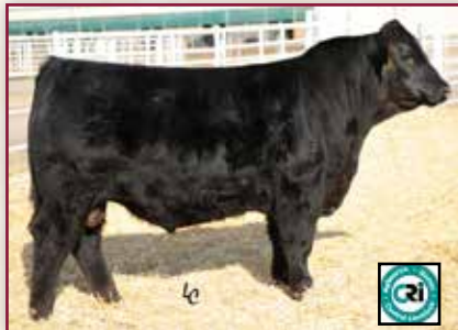
WS ALL AROUND Z35 All-Around's first calves were all we needed to know that this bull will sire the great ones. His EPD profile is about as good as it gets. Several sons sell in this sale.