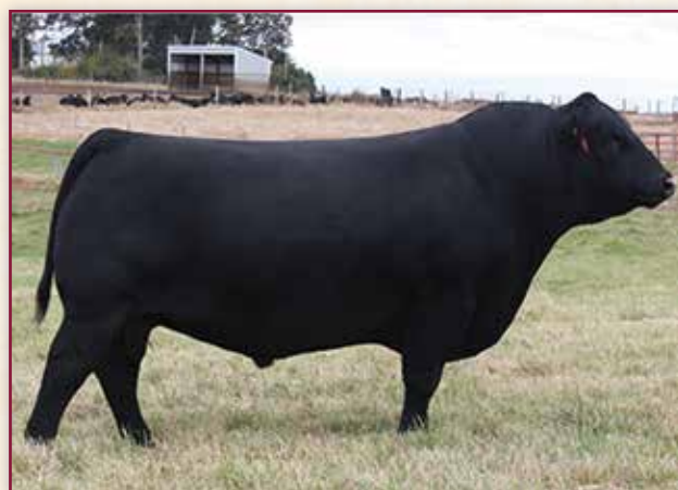
GW-WBF SUBSTANCE 820Y // SIRE TO LOT 19

Homo Polled & Homo Black. A high powered Et Substance out of our X192 donor cow. She is a favorite around here. This guy should raise some tremendous feeder calves that will gain, and marble, as well.