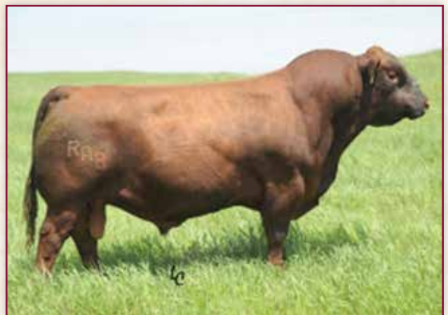
BIEBER ROOSEVELT W384 // SIRE TO LOT 47

Homo Polled. A deep, dark red, half-blood bull out of a beautiful High Stakes heifer Aaron flushed last year. I really like the length and thickness on this calf. I would expect maternal to be exceptional. Full brother sells as Lot 50.