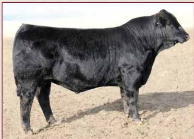
WS HOT BEEF X38 // SIRE TO LOT 11