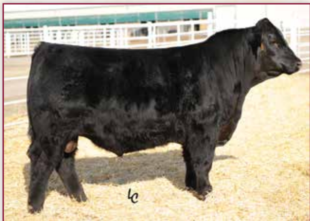
WS ALL-AROUND Z35 // SIRE TO LOT 17

Homo Polled & Hetero Black. A black ET calf who was the only bull born from this mating, with five full sisters. There is some power in this bull. He ranks in the top of the breed for growth and maternal. We have sold several high dollar offspring from his beautiful donor dam.