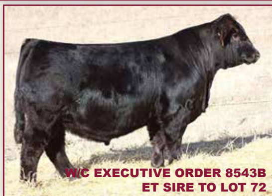
W/C EXECUTIVE ORDER 8543B ET SIRE TO LOT 72