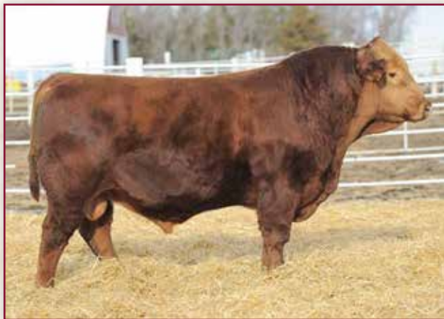
CDI VERDICT 220Y // SIRE TO LOT 41