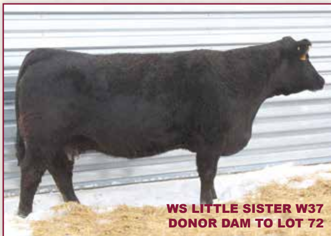
WS LITTLE SISTER W37 DONOR DAM TO LOT 72