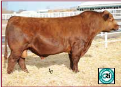
WS BEEF KING W107 Beef King is easily the best and most consistent bull we've ever used. From calving, tremendous growth, carcass, and good uddered cows, he does it all. He is 7 years old now, and running out with the cows in the field. He looks and moves like a two year old.